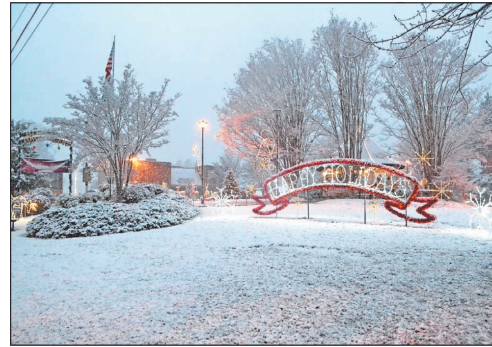
The Hiawassee Town Square looked particularly festive with its new lights and snow during