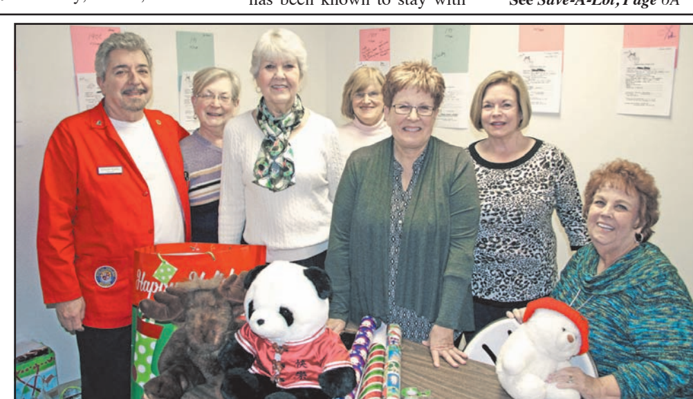
Volunteers with the "Foster Children's Christmas Program," during the 2016 Christmas season.